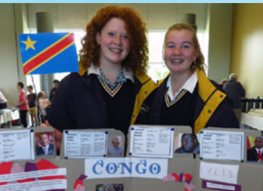
Students exhibit their passion projects at HTAA's HEP Highlights Exhibition